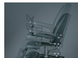
power seat lift

Quick folding of the back rest makes it easy to transport DX Compact in the back of car like a station wagon.