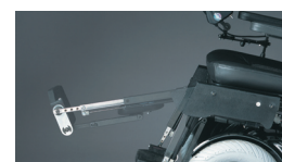
power leg support